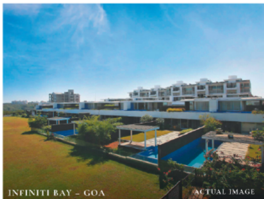
INFINITI BAY – GOA

Building luxury holiday homes in Goa since 2007